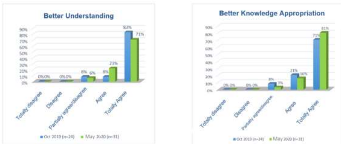
Figure 4. Results August-December 2019 and February-June 2020 Semesters: Learning Perception.