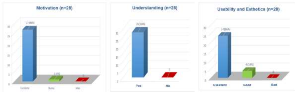
Figure 2. Results of January-May 2019 semester