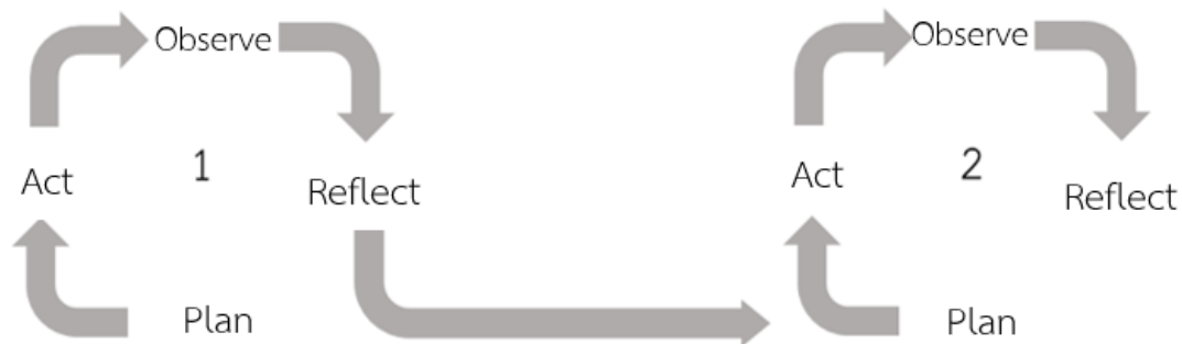
Figure 2. Processes of action research

was designed to be in two learning circles of planning, acting, observing, and reflecting. The processes of data collection could be seen below.