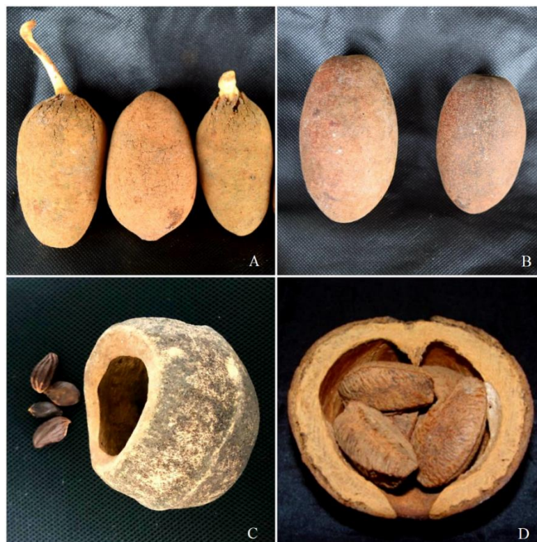
Fig. 2. Edible NTFP nuts in Brazil. Legend: A - Egg nut ( Acioa longipendula Pilg.), B - Cutia nut ( Acioa edulis Prance), C - Sapucaia nut ( Lecythis Pisonis ) and D - Brazil nut ( Bertholletia excelsa ).